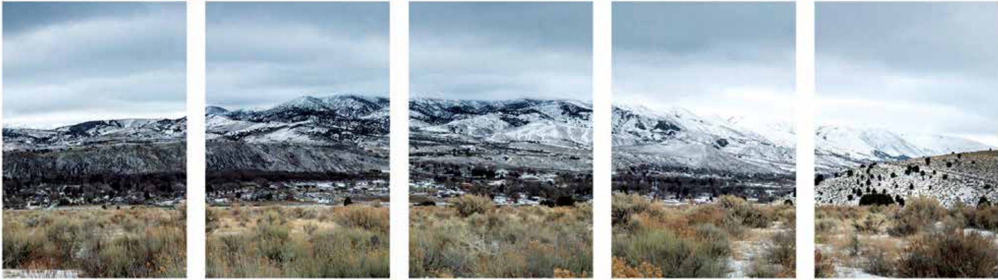
Pocatello, Idaho, Valley