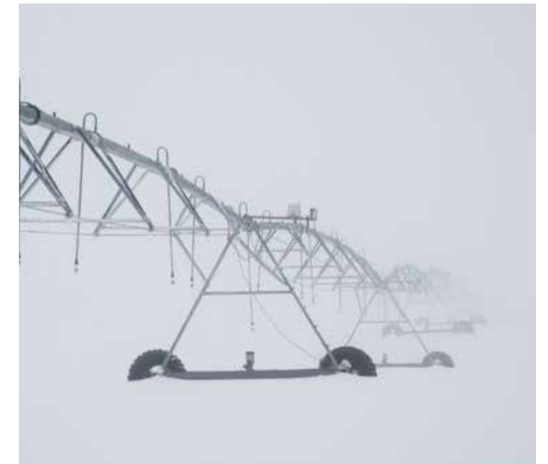
Rexburg, Idaho, Fields