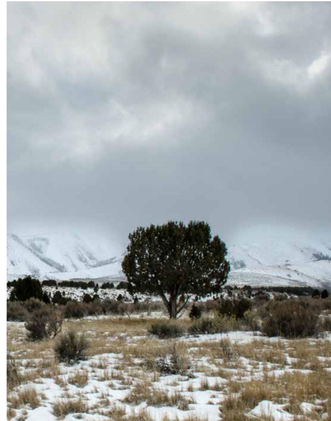
Pocatello, Idaho, Valley